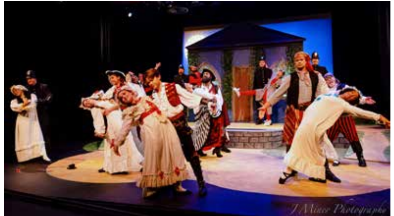
Clockwise from top left: (1) July 22, Pirates Concert at Capitol Lakes, (2) August 6, Free Children's Pirates Pre-show, (3) August 3-12 Madison Savoyards presented The Pirates of Penzance at the Bartell Theatre, and (4) December 3, caroling on Monroe Street